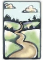
The Year Awaits

“There’s a song in every silence, seeking word and melody; there’s a dawn in every darkness, bringing hope to you and me. From the past will come the future; what it holds, a mystery, unrevealed until its season, something God alone can see.”